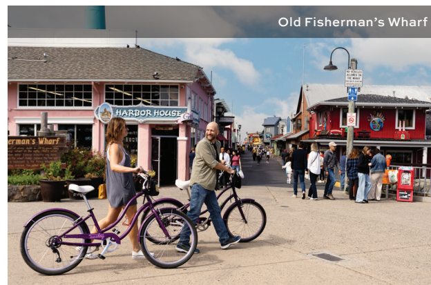
Old Fisherman's Wharf