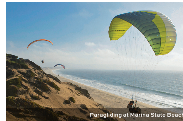
Paragliding at Marina State Beach