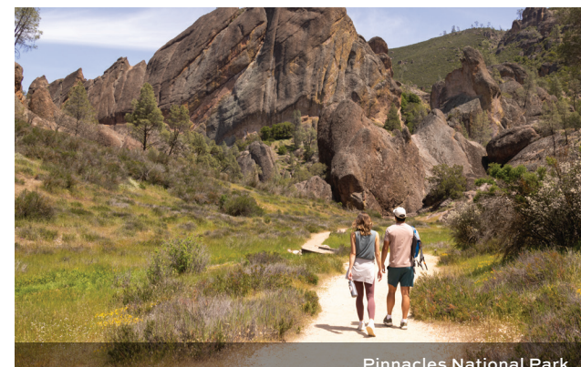
Pinnacles National Park