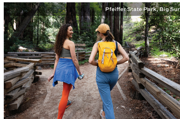
Pfeiffer State Park, Big Sur