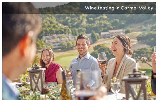
Wine tasting in Carmel Valley